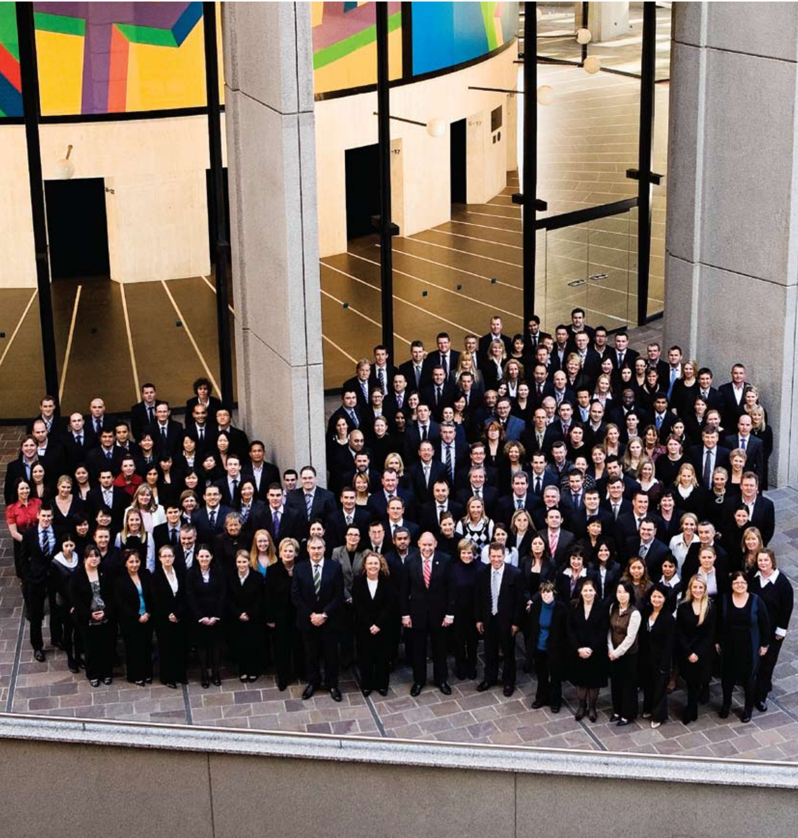
Members of the DEXUS team at Australia Square, Sydney, NSW